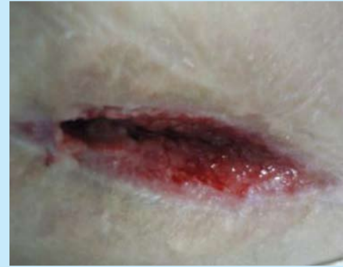
Figure 4: Wound after 4 weeks NPWT