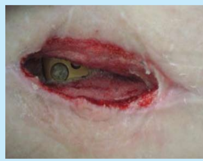
Figure 3: Wound at presentation