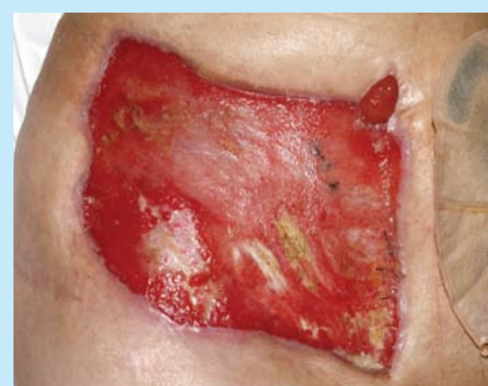
Figure 10: Wound after 7 weeks of NPWT prior to Kendall AMD antimicrobial foam dressing