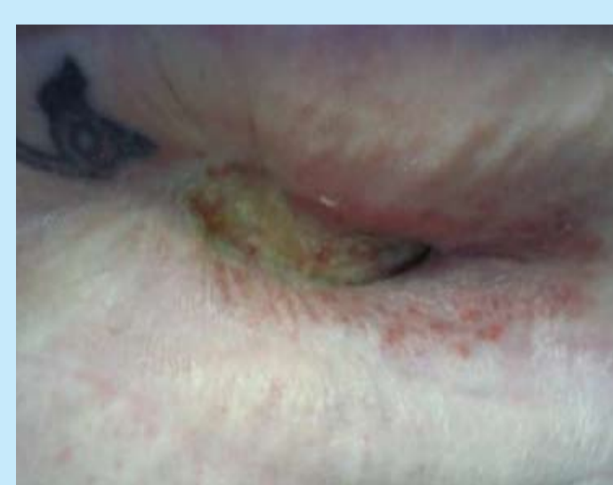
Figure 7: Wound after 3.5 weeks and prior to Kendall AMD antimicrobial foam dressing