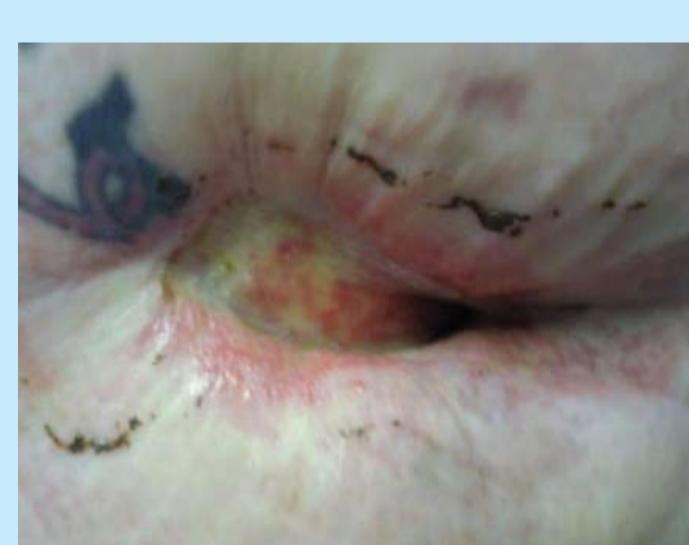
Figure 6: Wound prior to NPWT