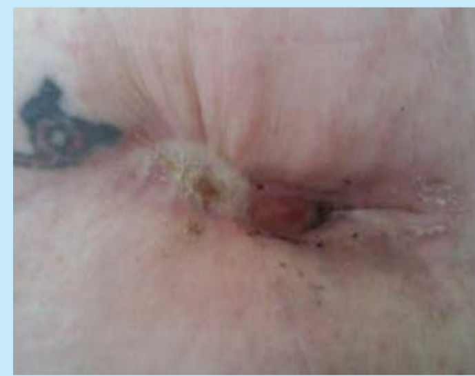
Figure 8: Mastectomy wound after 5 weeks of Kendall AMD antimicrobial foam dressing