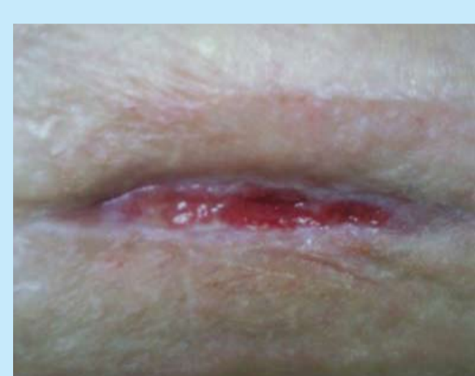
Figure 5: After 3 weeks application of Kendall AMD antimicrobial foam dressing