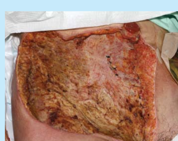
Figure 9: Wound on presentation to the Wound Care Service