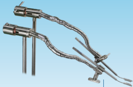
Octopus™ 1 1997