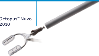
Octopus™ Nuvo 2010

Legacy Octopus models 1, 2, 2+, 2+ low profile, 3, 4 and TE are no longer available for sale.