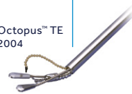
Octopus™ TE 2004