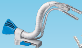
Octopus™ 3 2000