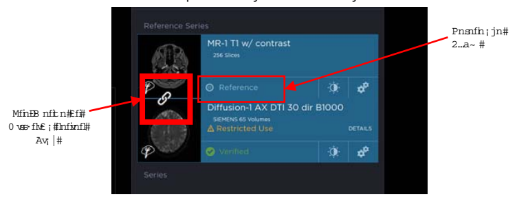
Figure 3. Pre-Merge/Diffusion Merge with Reference

Note : The icon link in Figure 3 , below indicates the use of pre-merge or diffusion merge. Merged images without this icon link is not impacted by this anomaly.