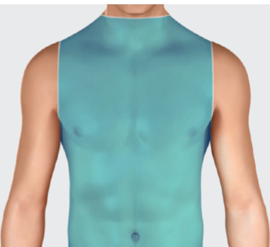
1. Prep for vest

The vest comes in three pieces — two front panels and one back panel. The panels have an adhesive that holds the vest in place. Hospital personnel will need to clean and shave your chest, stomach, and back to ensure the vest stays in place.