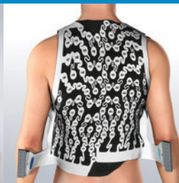
4. Apply back panel