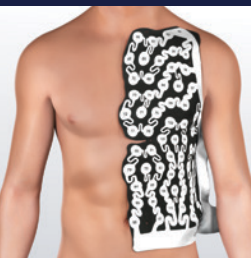
2. Apply left panel

The vest comes in three pieces — two front panels and one back panel. The panels have an adhesive that holds the vest in place. Hospital personnel will need to clean and shave your chest, stomach, and back to ensure the vest stays in place.