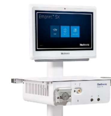
Emprint™ ablation system