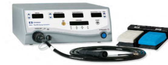
Barrx™ radio-frequency ablation system

For more information email: rs.gisinsidesales@medtronic.com