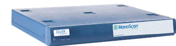
ManoScan™ high resolution manometry system