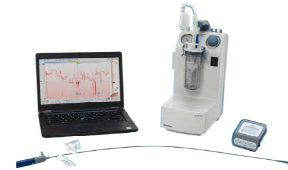
Bravo™ calibration free reflux testing system