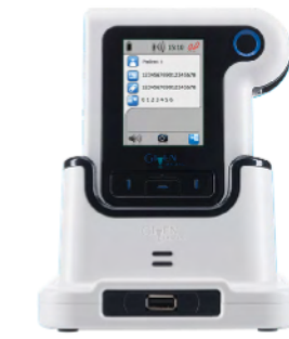
PillCam™ capsule endoscopy system