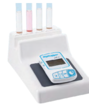
Digitrapper™ pH-Z testing system