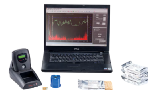
SmartPill™ motility testing system