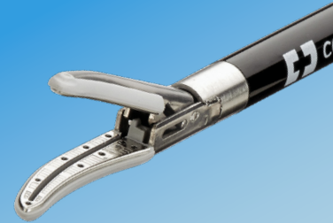
LigaSure™ Maryland jaw device