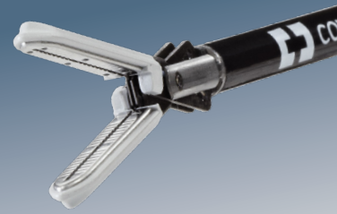
LigaSure™ blunt tip device

Elastomeric silicon, the original Valleylab™ energy nonstick coating, allows the electrode to bend up to 90 degrees without compromising the coating's integrity. It's thick on the flat surface of the electrode and very thin along the edges.