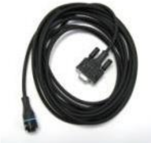
5. HeatWare™ Alarm Adapter