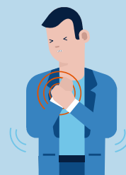
Chest discomfort or pain