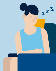
Chronic lack of energy