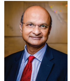
Omar Ishrak, Ph.D. Chairman and Chief Executive Officer, Medtronic

“Together with MUSC, we are committed to fundamentally improving the way patient care is delivered,” said Omar Ishrak, Medtronic chairman and chief executive officer. “Medtronic has a long history of collaboration with health care providers to invent and develop new markets to solve a variety of clinical problems. The partnership with MUSC is an extension of that collaboration, as we look to systematically work together to develop scalable programs aimed at improving patient outcomes while reducing the cost of care.”