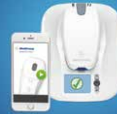
MyCareLink Smart™ and MyCareLink™ Patient Monitors

Your clinic reviews your device information on a secure website.