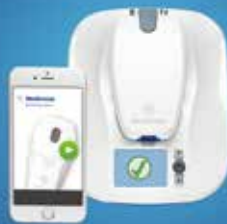
MyCareLink Smart™ and MyCareLink™ Patient Monitors

** Ability to leave voicemail outside of office hours