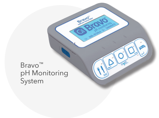
Bravo™ pH Monitoring System

Motility disorders often mimic symptoms of GERD, making diagnosis of esophageal symptomatic patients a challenge 3