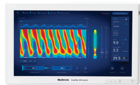
Endoflip™ 300 System