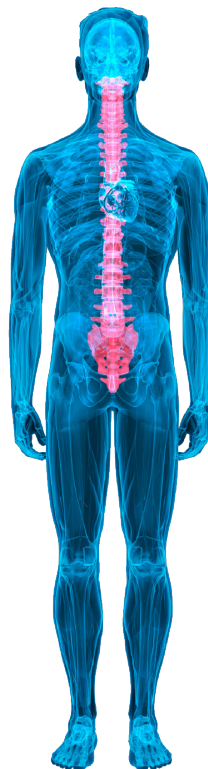
Spinal & Orthopedics