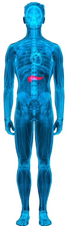
Digestive & Gastrointestinal