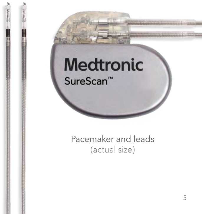
Pacemaker and leads (actual size)