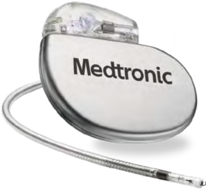
Traditional single-chamber pacemaker and lead

Micra is intended for patients with specific pacing needs. Talk to your doctor about the benefits and risks of Micra.