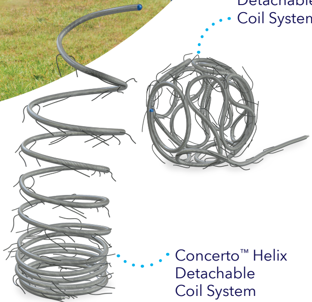
Concerto™ Helix Detachable Coil System