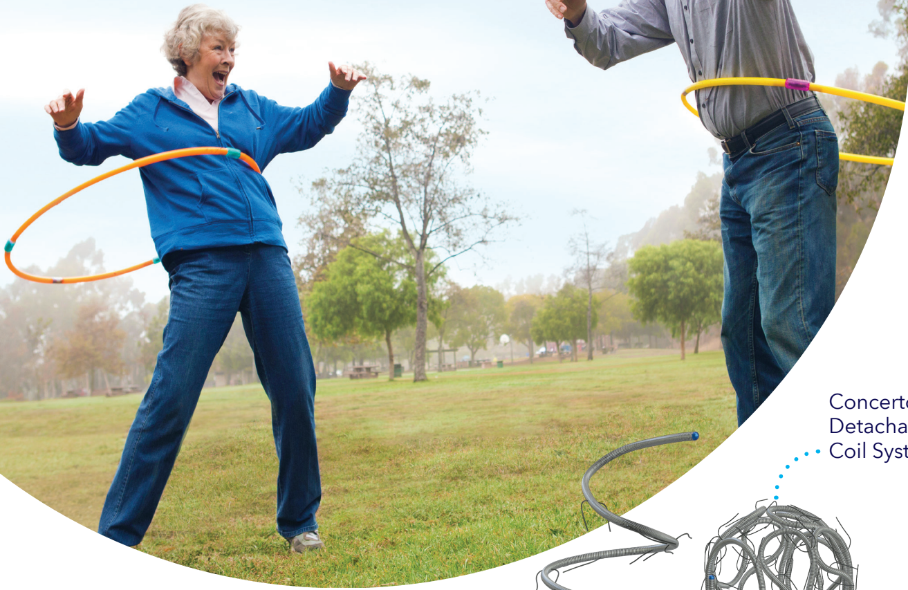
Concerto™ 3D Detachable Coil System