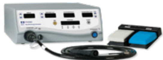
Barrx™ radio-frequency ablation system