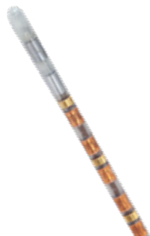
ManoScan™ high resolution manometry catheters