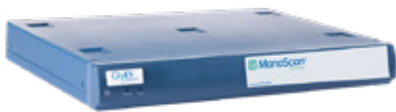
ManoScan™ high resolution manometry system