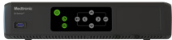
GI Genius™ intelligent endoscopy system

For more information email: dl.endorams@medtronic.com