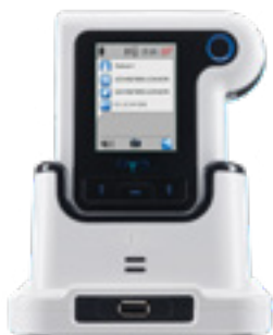
PillCam™ capsule endoscopy system