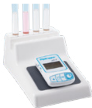
Digitrapper™ pH-Z testing system