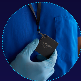
ProxiLinq™ relay connection

Capture your entire case with exclusive CaseCapture™ retrospective recording