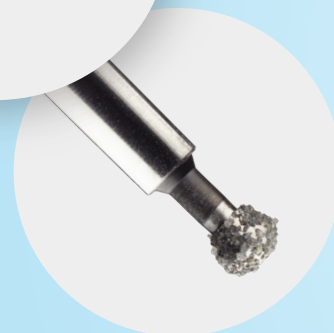
30K high-speed burs