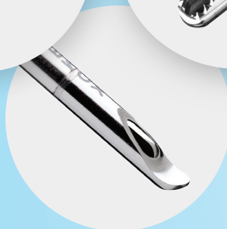
Inferior turbinate blade