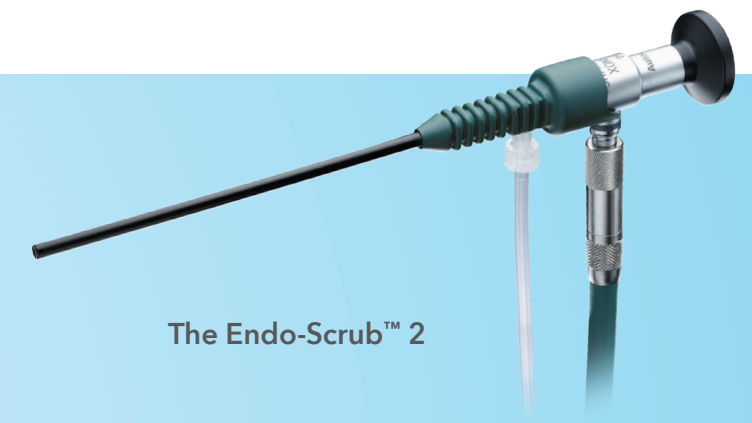
The Endo-Scrub™ 2