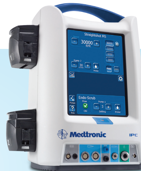
Integrated Power Console (IPC™ system)

Normal mucosa helps warm and humidify the air, and contains thousands of cilia that facilitate drainage. The microdebrider resects tissue more precisely and causes less mucosal damage than traditional instruments. 6-8