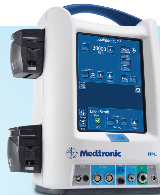
Integrated Power Console (IPC™ System)

Endo-Scrub™ 2 lens cleaning sheaths ensure that fluid is evacuated from the sheath to keep the lens from fogging.