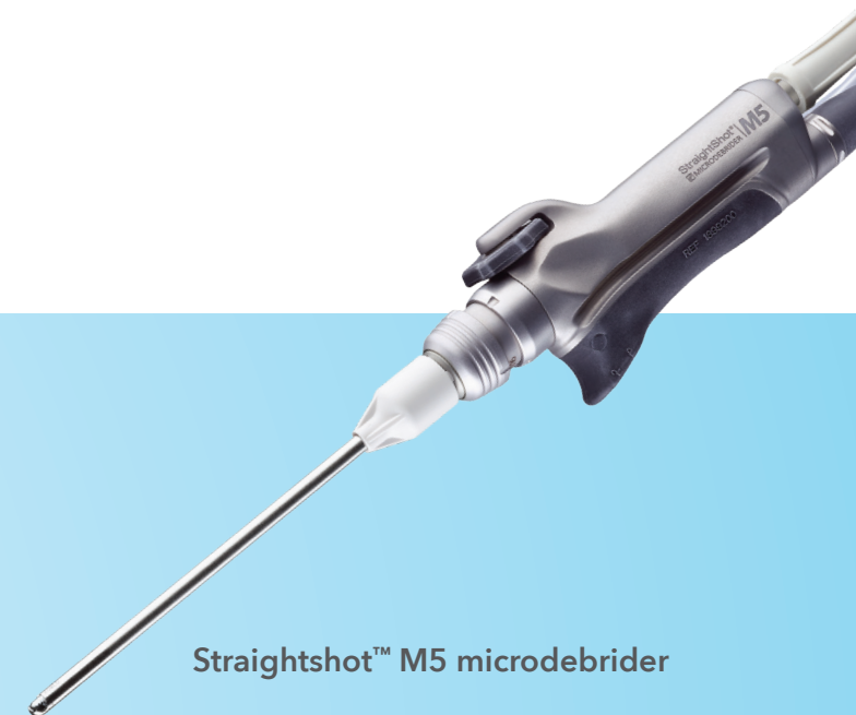
Straightshot™ M5 microdebrider