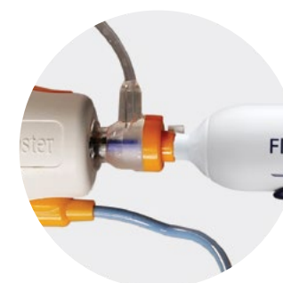
Biosense Webster CARTO VIZIGO® Bi-directional Guiding Sheath