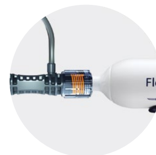
Boston Scientific Watchman™ TruSeal™ and FXD™ Access Systems++