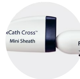
Medtronic FlexCath Cross™ with Mini Sheath