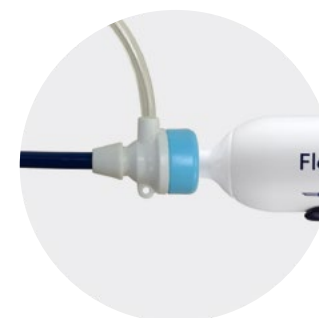
Merit Medical HeartSpan® Sheath Introducer