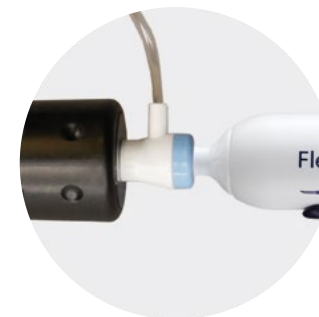
Abbott Agilis™ NxT Steerable Introducer