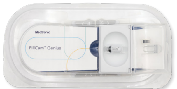
PillCam™ Genius SB kit

Designed to streamline procedures – our single-use capsule and link device enable ingestion from the comfort of your own home, during telehealth appointments and can be simply returned in-person or by mail. 1 The PillCam™ Genius SB kit brings a new freedom for physicians and patients by being able to perform capsule endoscopy when it is needed most.